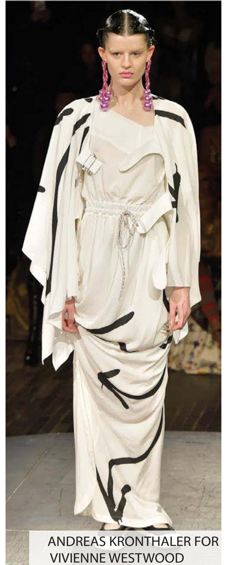
ANDREAS KRONTHALER FOR VIVIENNE WESTWOOD