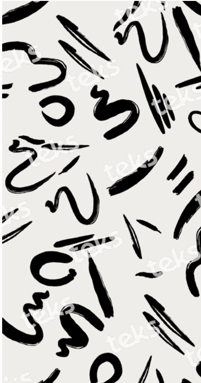
REFERENCIA: LINO LYON BASE: LINO MILAN