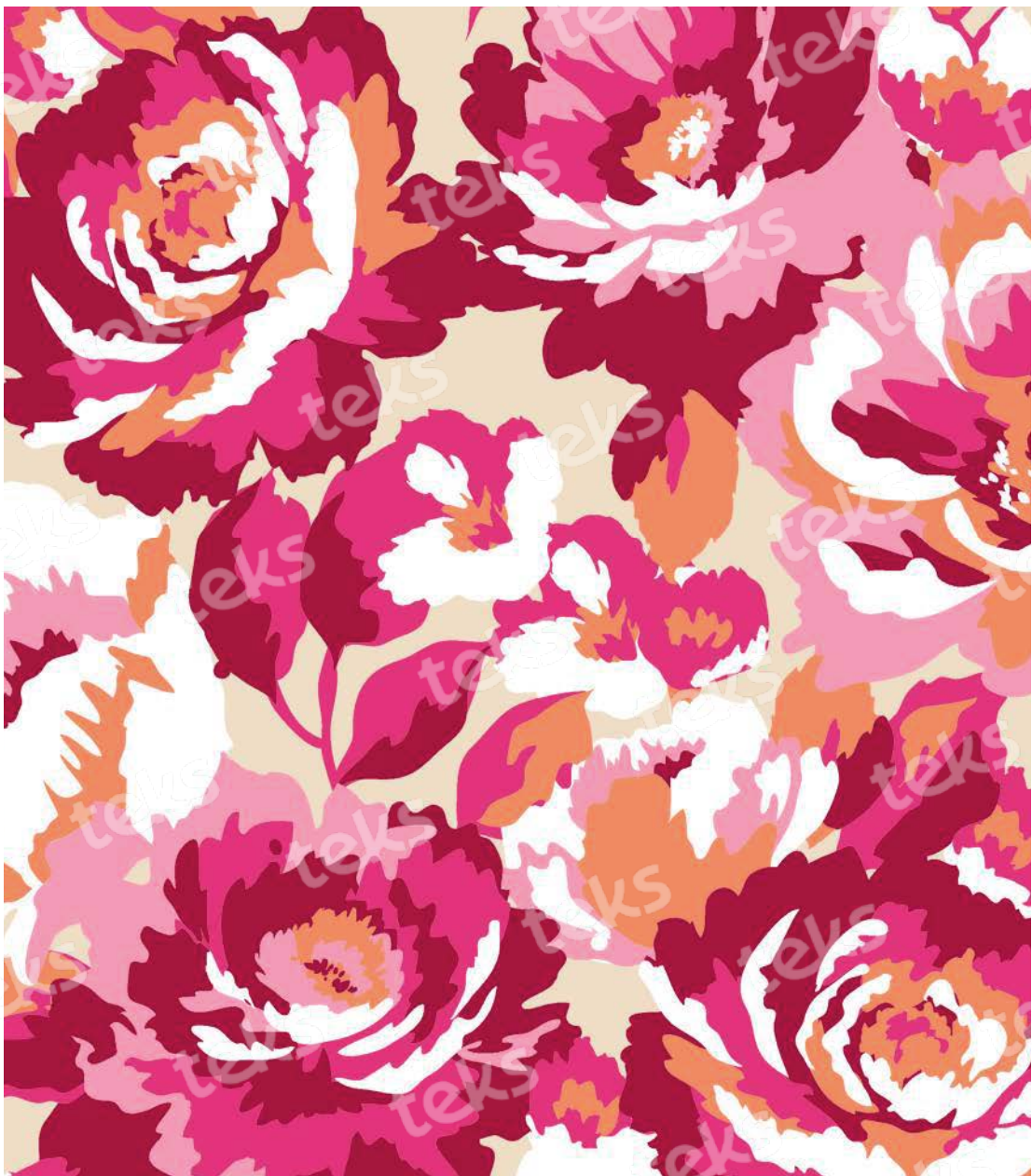
BASE: CHALIS SUPREMO NOMBRE: CHAL JACINTO