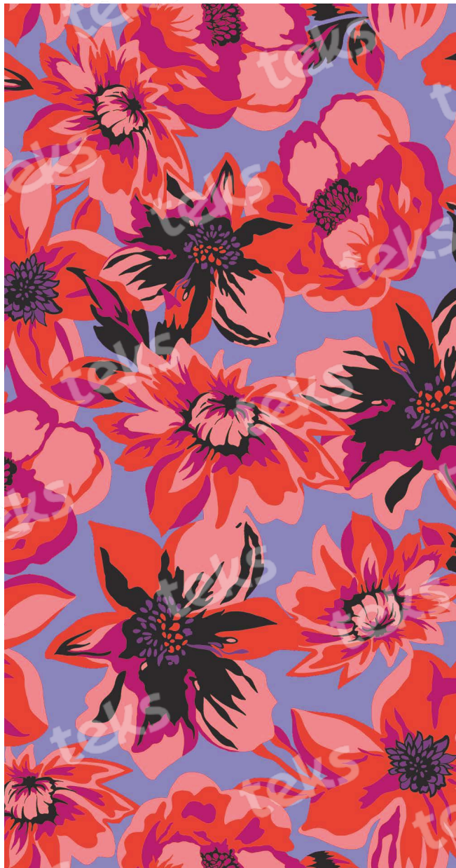
BASE: VALIANA NOMBRE: VALI SUNDAISY