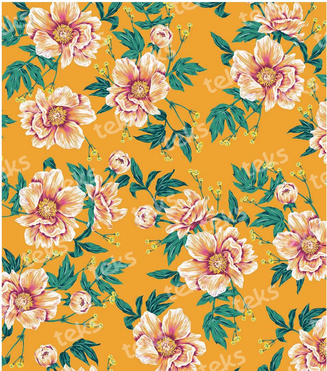
BASE: SEDUCTION NOMBRE: SEDU NARCISO