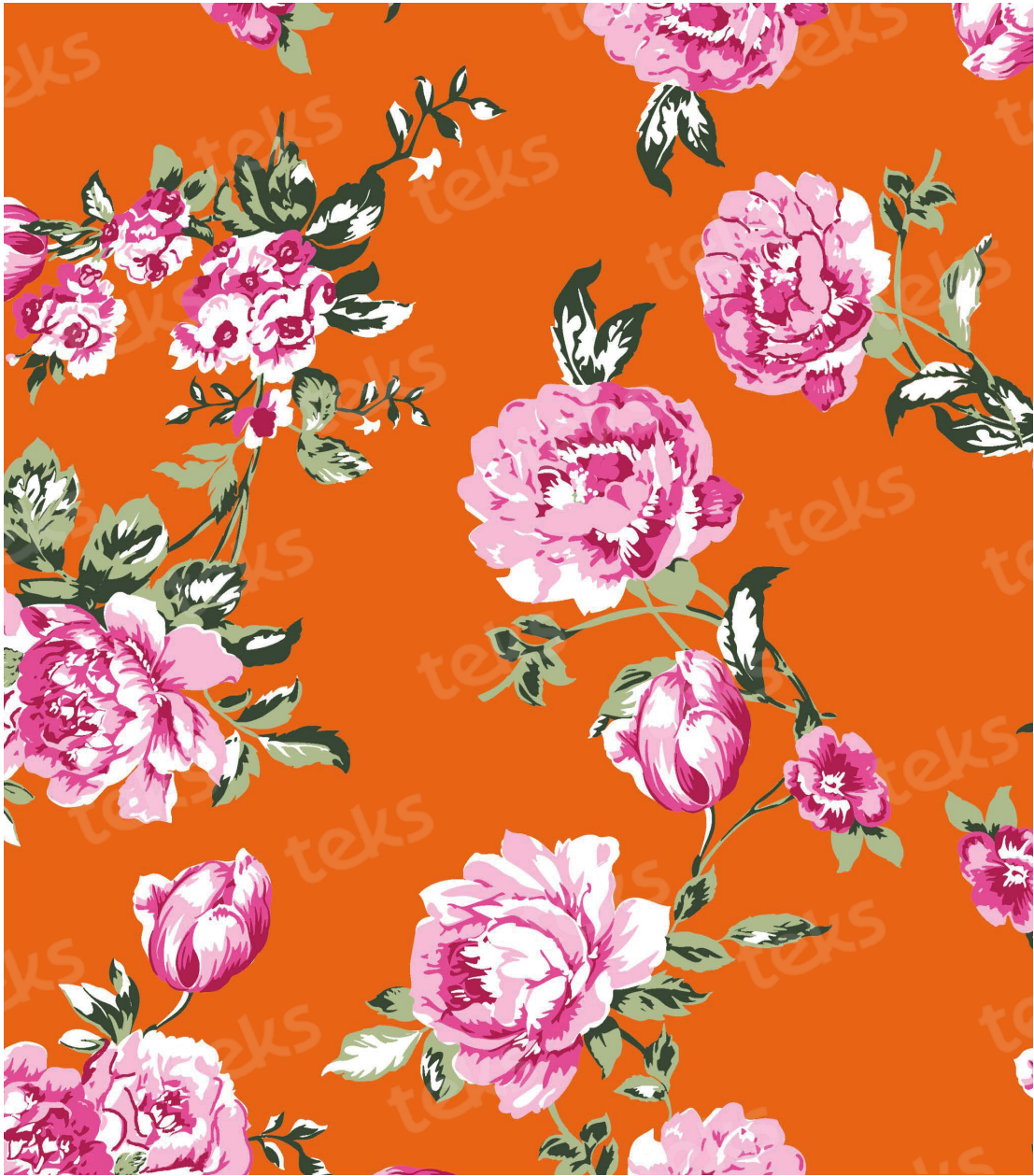
BASE: KABU NOMBRE: KABU DELROSAL