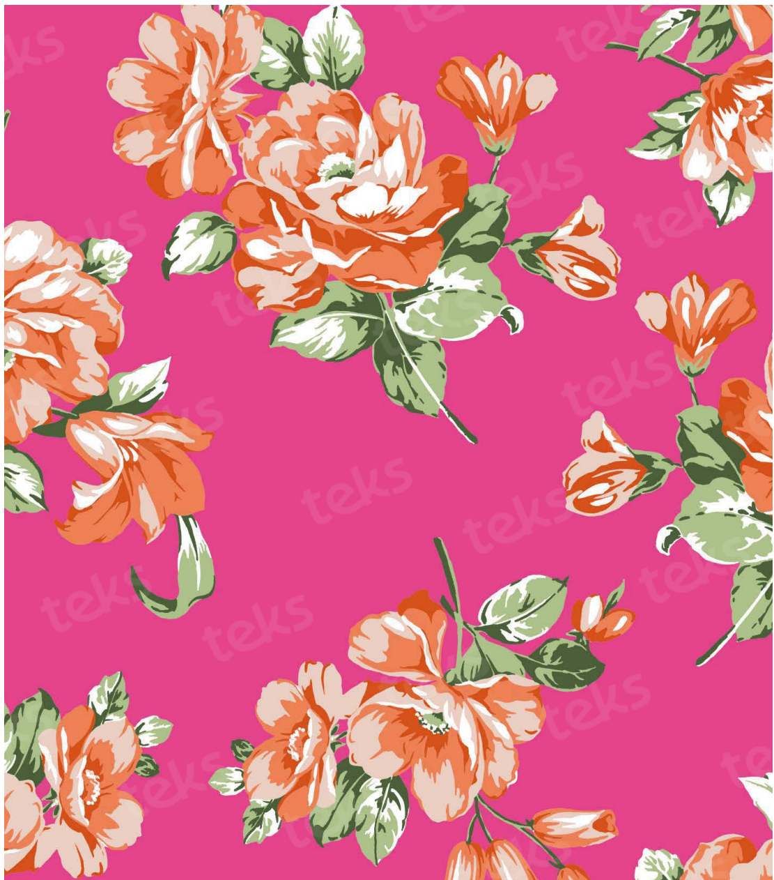
BASE: SEDUCTION NOMBRE: SEDU MARACUYÁ